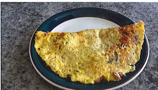
An Omelet prepared by the Men 's Cooking Group

When queried about whether they like all the food ?